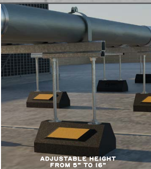
ADJUSTABLE HEIGHT FROM 5" TO 16"