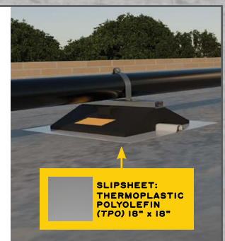
SLIPSHEET: THERMOPLASTIC POLYOLEFIN (TPO) 18" x 18"

ALSO AVAILABLE IN 24", 36", AND 48" LENGTHS