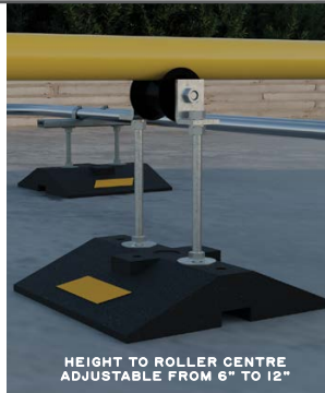
HEIGHT TO ROLLER CENTRE ADJUSTABLE FROM 6" TO 12"

ALSO AVAILABLE IN 16" MAX. HEIGHT TO ROLLER CENTRE